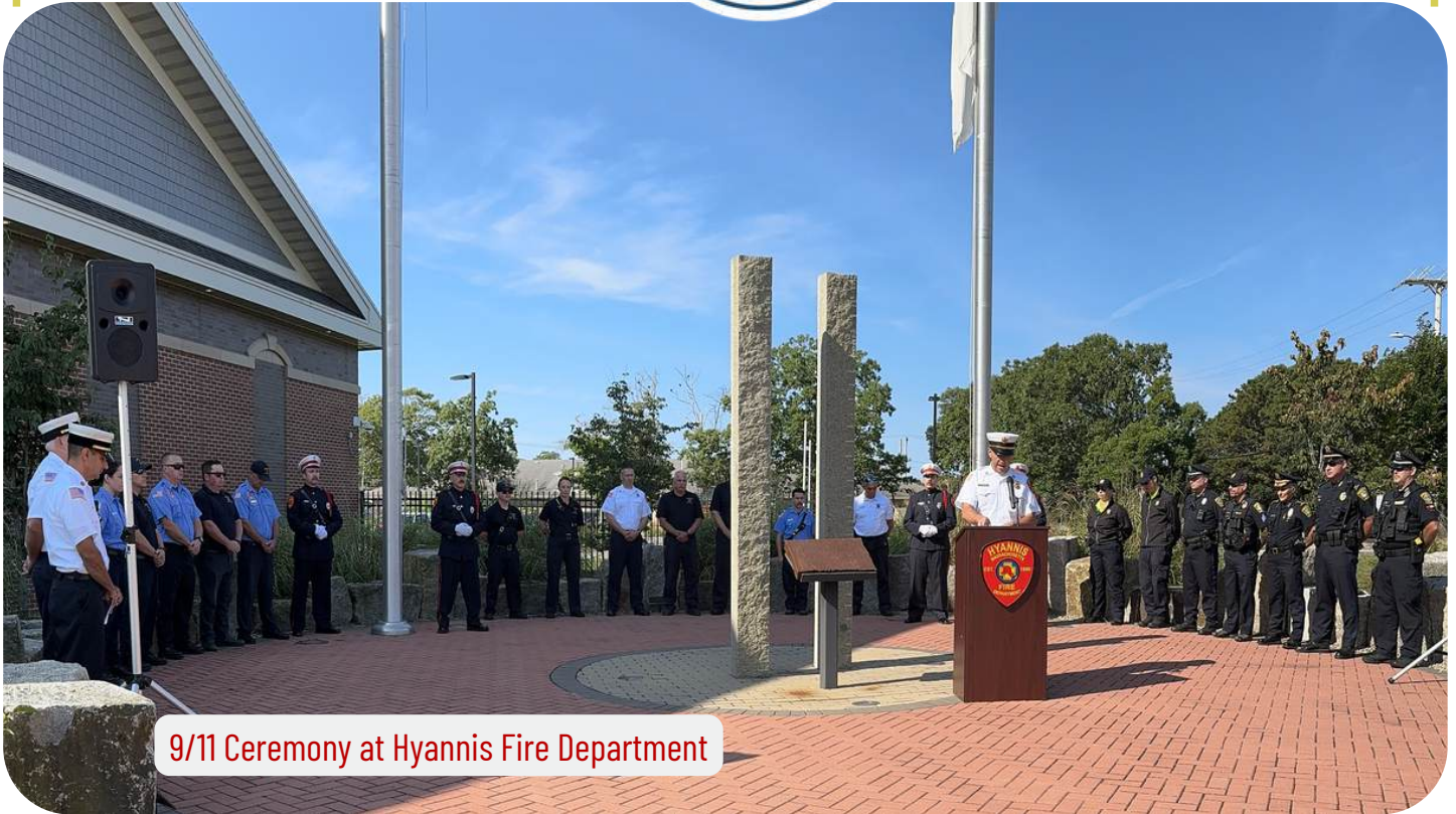
9/11 Ceremony at Hyannis Fire Department