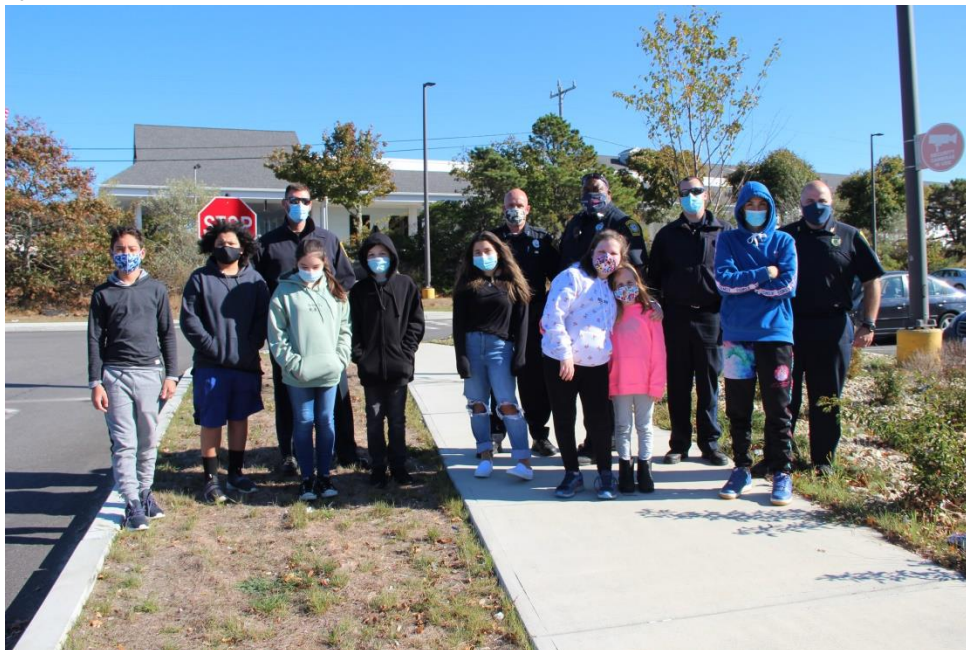
On Thursday, October 8 th , members of the Barnstable Police Department took students from the Barnstable Intermediate School for their annual Shop with A Cop event which included lunch at Tugboats following by shopping at a local retailer.