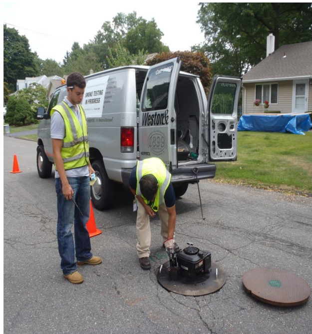
Setup of smoke blower.