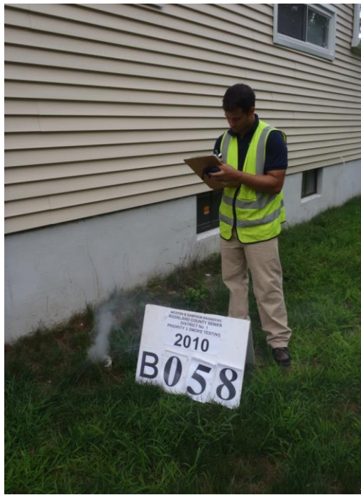
Recording of smoking defect.