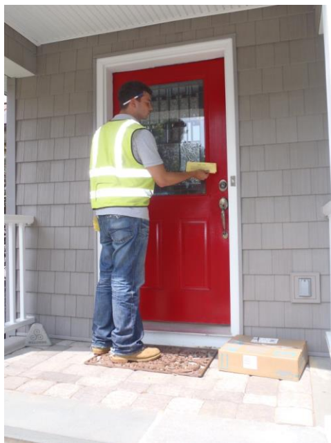
Pre-Noticing to home owners.

If you work during the day, please take precautions to ventilate the area where your pet will be.