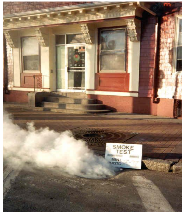
Catch basin tied directly into sanitary sewer system.