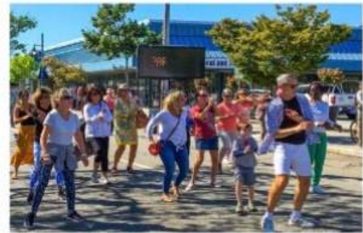
Family Fun! Street Closure Main St., Hyannis between Barnstable Rd. & Sea St.