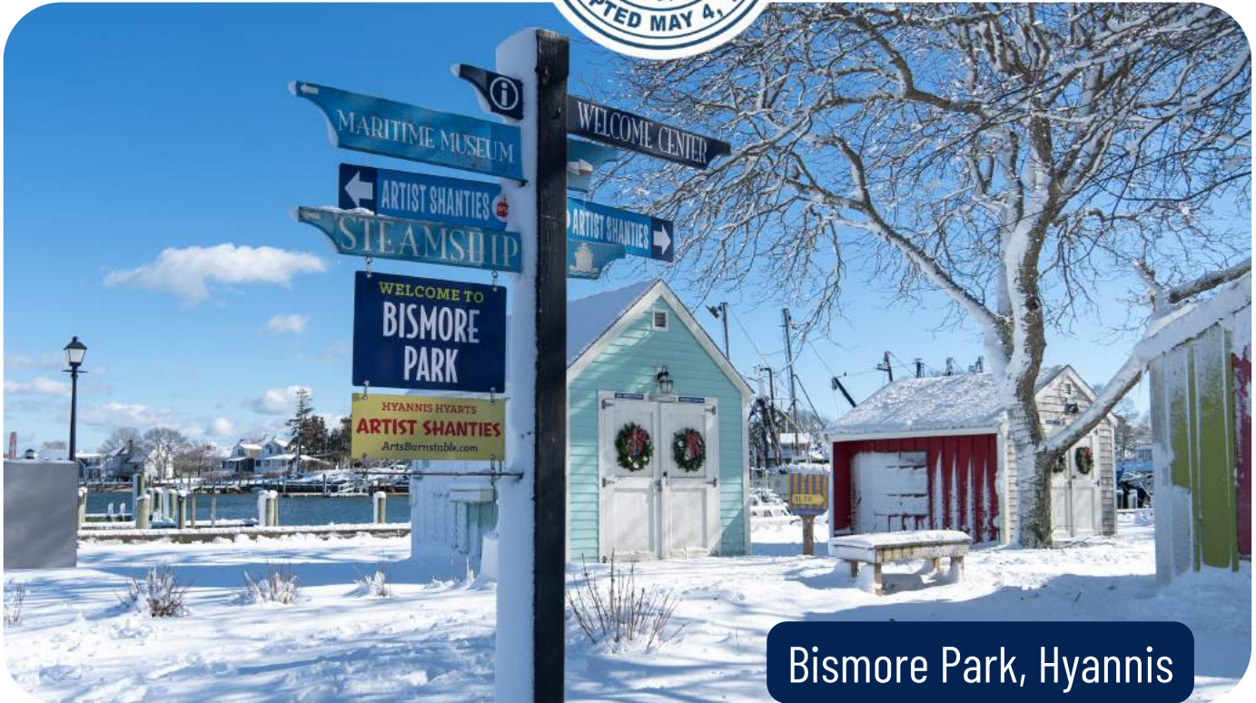
Bismore Park, Hyannis