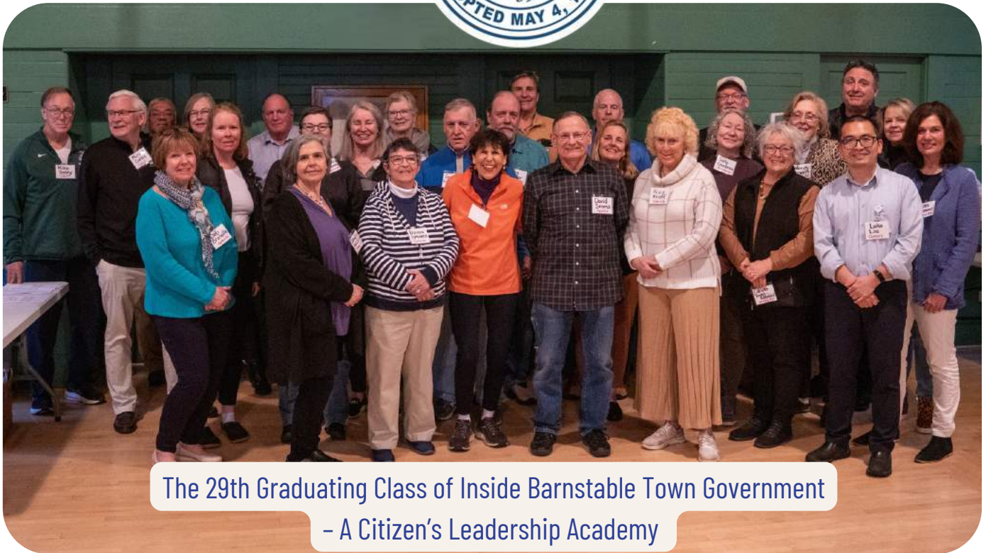
The 29th Graduating Class of Inside Barnstable Town Government - A Citizen's Leadership Academy