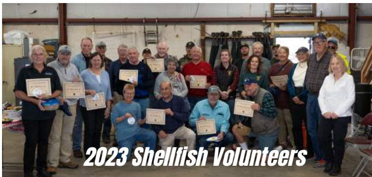
2023 Shellfish Volunteers

Celebrating service and all the wonderful volunteers across the Town of Barnstable.