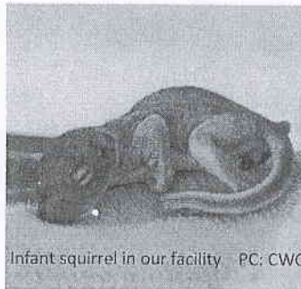
Infant squirrel in our facility

Squirrels have litters of up to 4 or 5 young twice a year, in early spring and midsummer. Small, "friendly" squirrels with skinny tails are still too young and need their mother's care. Young squirrels are out of their nests by six weeks and on their own by eight to nine weeks of age. If the nest is destroyed and mother is still around, she will move her young to another site.