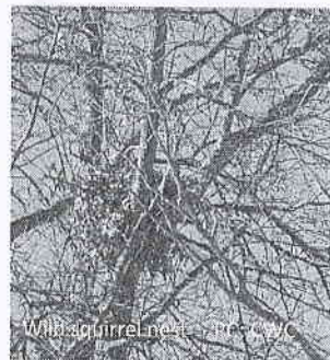
Wild squirrel nest

If the young squirrel is injured, mother does not return or you have any questions, call Cape Wildlife Center.