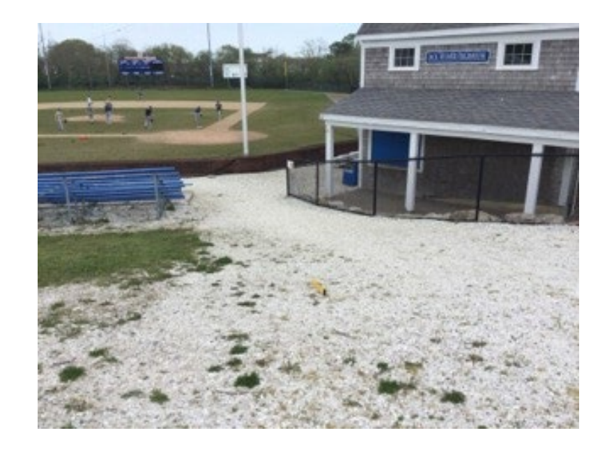
Town of Barnstable ADA Transition Plan