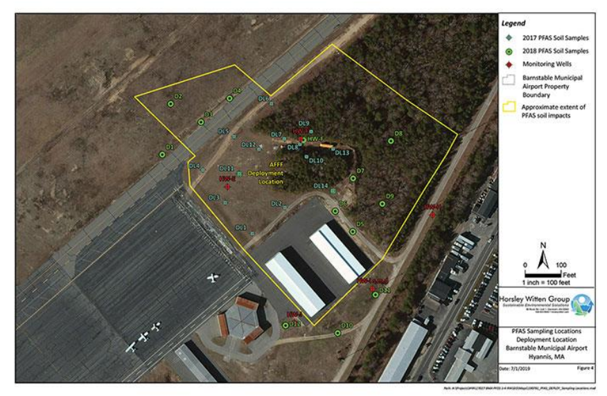
Annual Testing and Tri-Annual Drill Site Location (~ 1.79-acres)