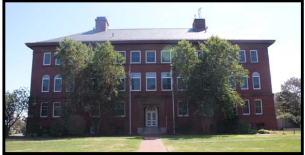
Town Hall Renovations, 2010