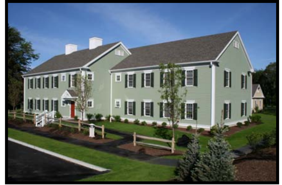
Lombard Community Housing, 2008