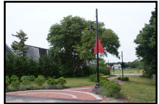
Hyannis Open Space Acquisition, 2008