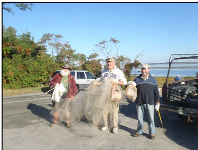
Barnstable Association for Recreational Shellfishing at Scudder's Lane Town Landing

A world wide campaign to remove litter and debris from shorelines received help from local groups and organizations. The 27th annual Coastsweep beach cleanups commenced on September 20, 2014. Volunteers combed the beaches, town landings, and ways-to-water of Barnstable, making them safer for people and marine animals. Cigarette butts, cans, bottles, straws, wrappers, fishing line, and myriad other trash were collected and properly disposed of.